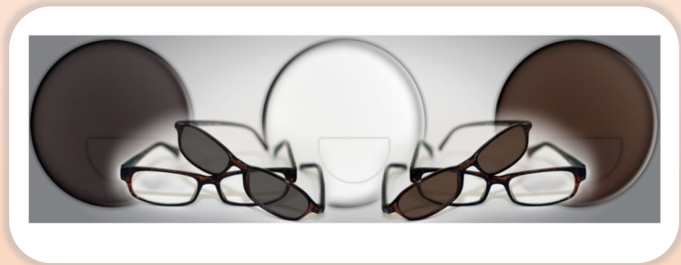
FT-28 Semi- Finished